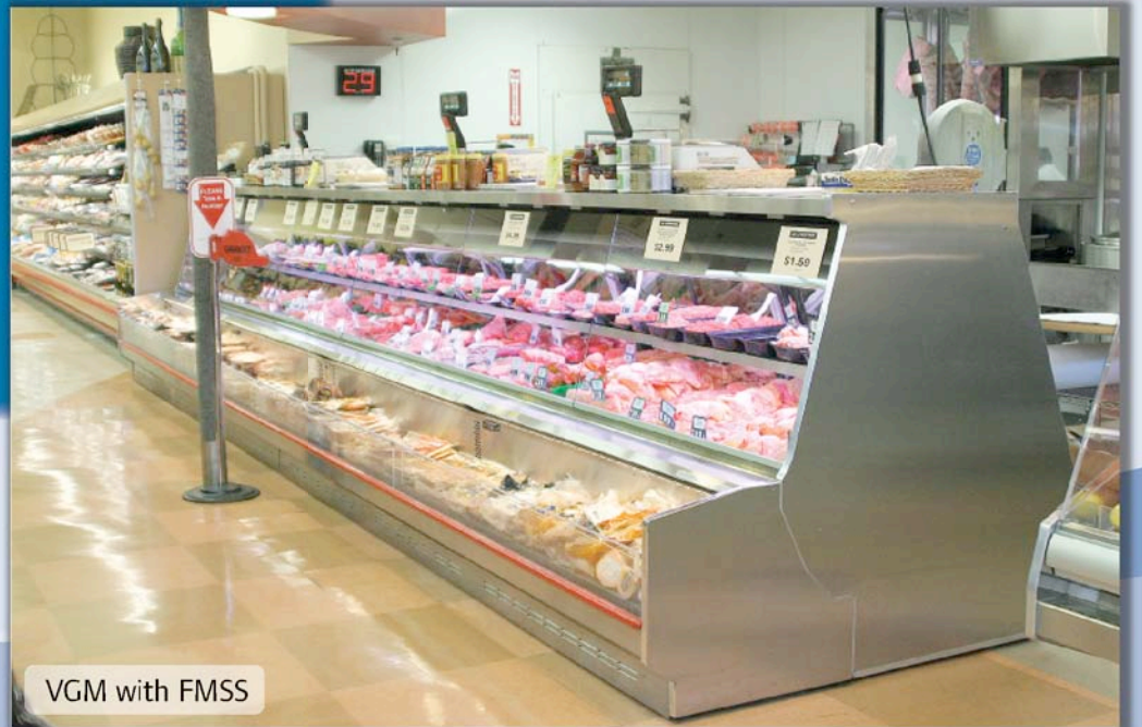
VGM with FMSS