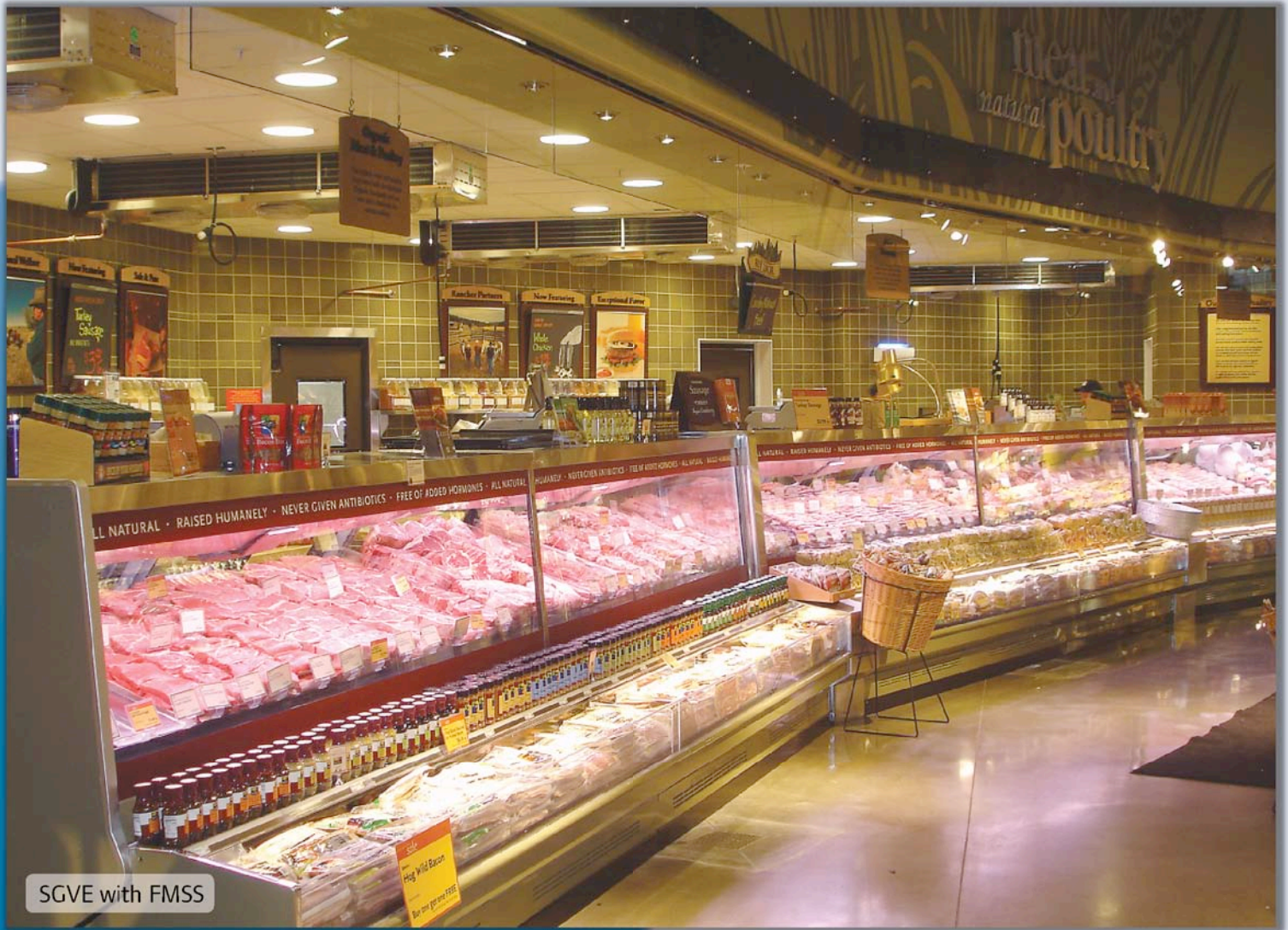
SGVE with FMSS