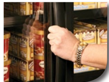
Microban protects shoppers' touch points like reach-in handles to stay cleaner between cleanings.