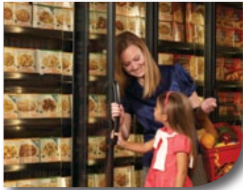
Reach-In Door Handles