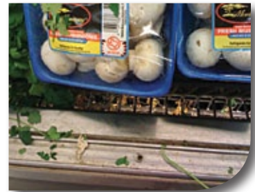
Microban protects produce shelving from stains, odors and mold that can be caused from moist environments.