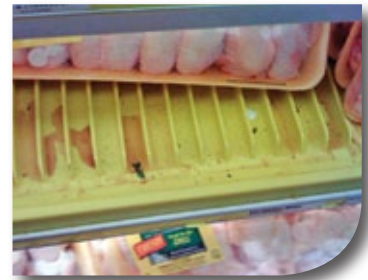
Microban protects shelves from bacterial odors and stains.