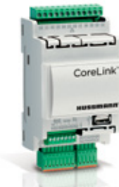
Shown: Hussmann CoreLink™ Controller