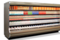
Shown: Excel D5X Multi-Deck Merchandisers