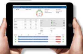
Shown: Hussmann CoreLink™ Control Interface