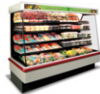
Shown: Excel P4X-EP Multi-Deck Merchandiser

Energy-efficient condensing unit solution designed with adaptive technology to refrigerate a variety of case and evaporator models.