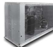
Shown: High Efficiency H-Series