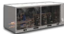
Shown: Proto-Aire EZ