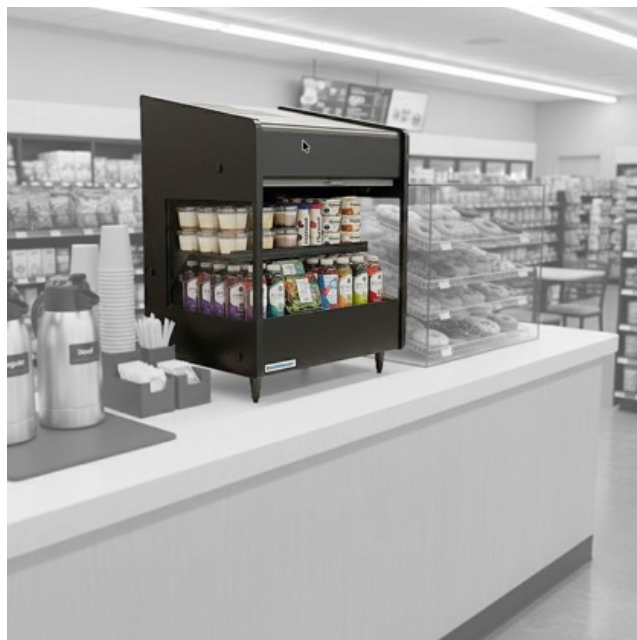
Shown with removable leveler legs