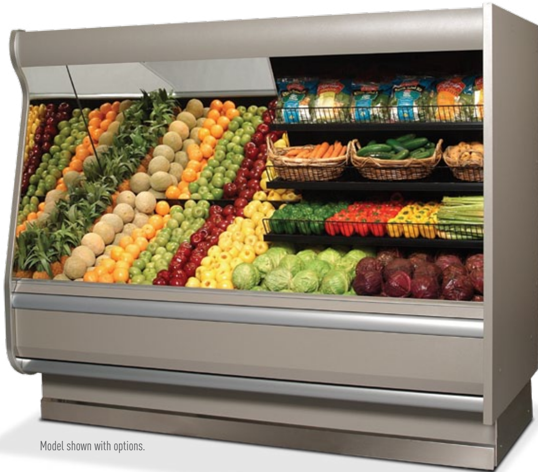
Model shown with options.