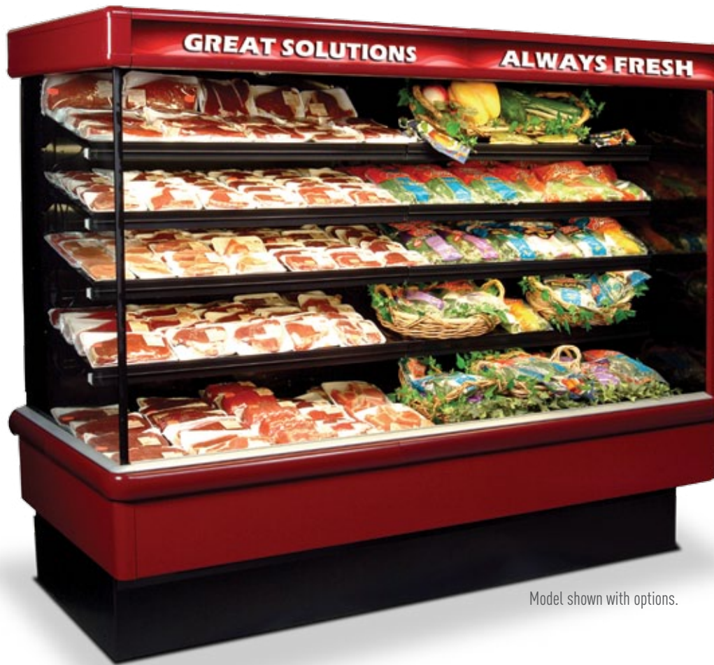
Model shown with options.