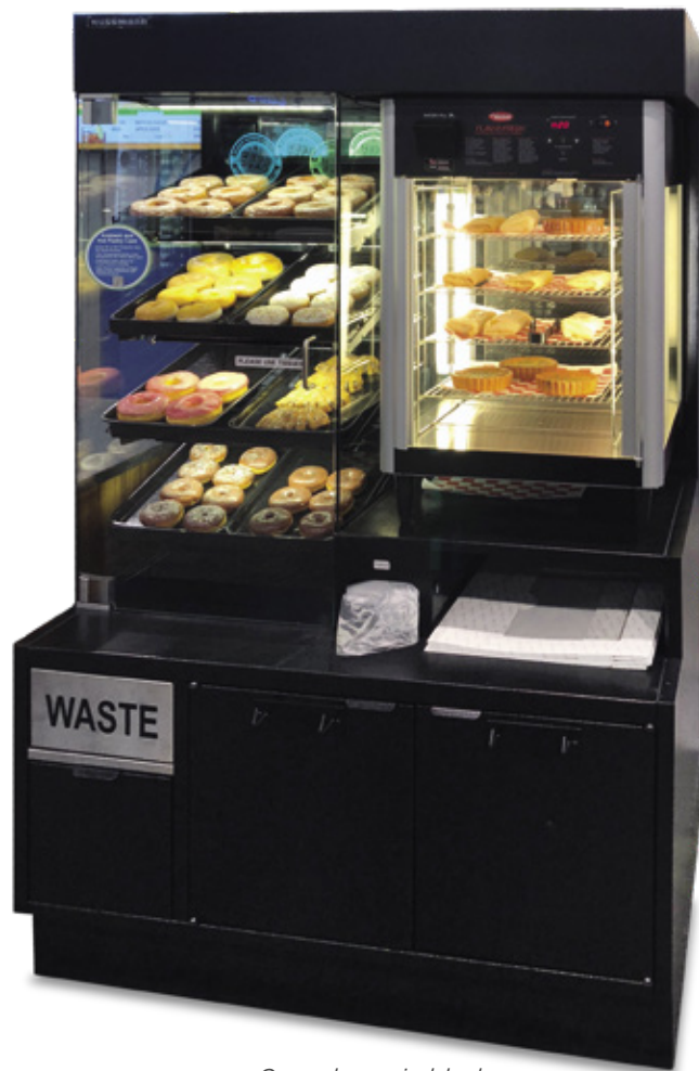
Case shown in black.