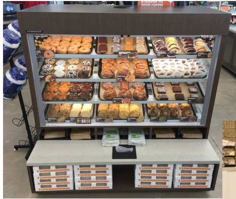
Optional package ledge shown above