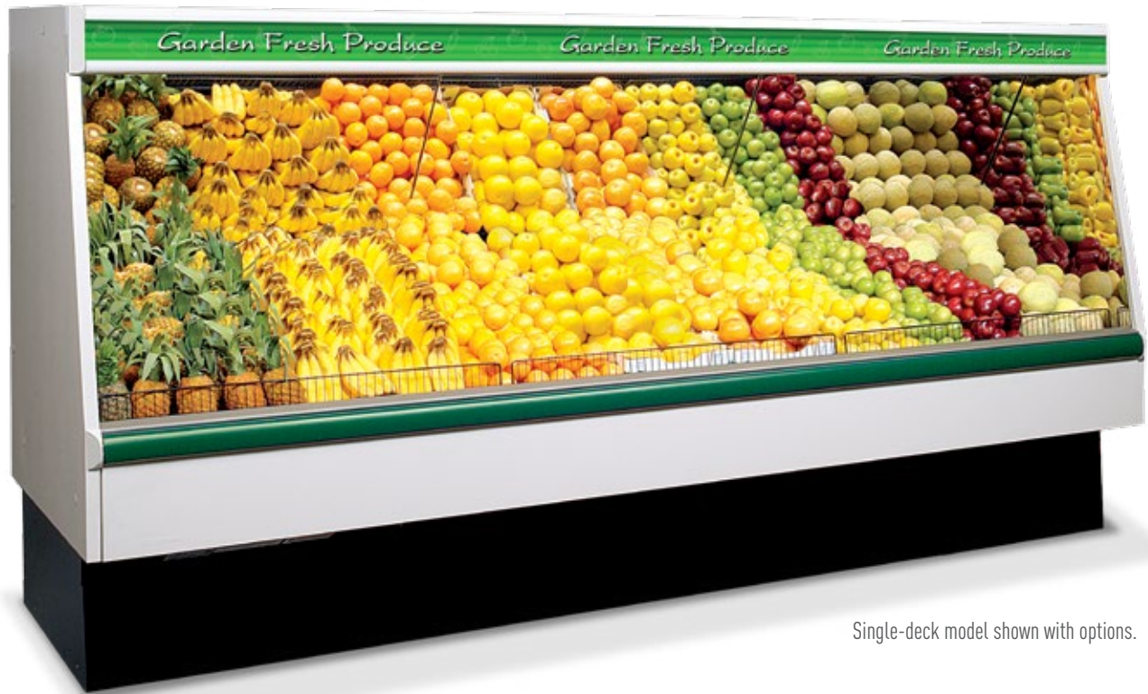
Single-deck model shown with options.