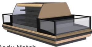
Isla Body Match