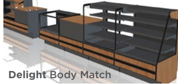
Delight Body Match