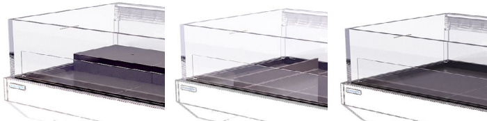
Risers for Reduced Pack Out and Creative Displays

Display a wide variety of products in unique formats