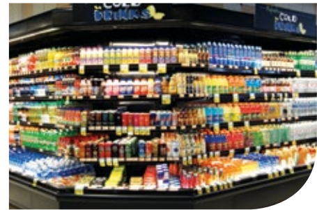
45° Outside Wedge