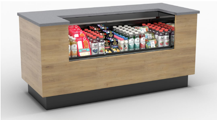
Built-in Counter example – millwork not included