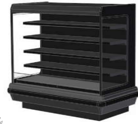
10" canopy depicted (-EC10)

DOE 2017 Energy Efficiency Compliant Hussmann refrigerated merchandisers configured for sale for use in the United States meet or surpass the requirements of the DOE 2017 energy efficiency standards.